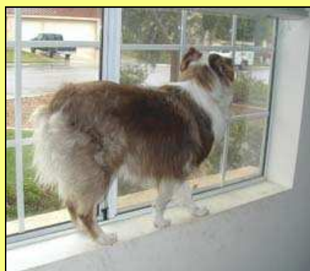
Figure 15 Amber April, 2001. Inside on a rainy day.