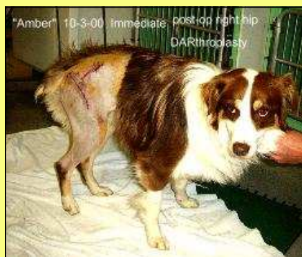
Figures 13 and 14. Amber immediately postoperative. Note that she is already putting weight on the right-rear leg that had just been operated on.

"Amber is quite happy and leads a very normal dog's life, along with our other Aussie, Hubie... Again I say, please use Amber as a perfect example of how good this surgery is."