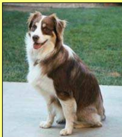
Figure 16 Sitting pretty on the patio.