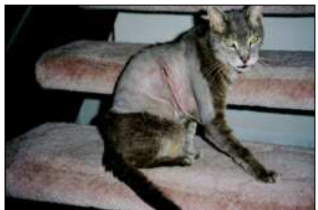
Foggie, three weeks post-op.